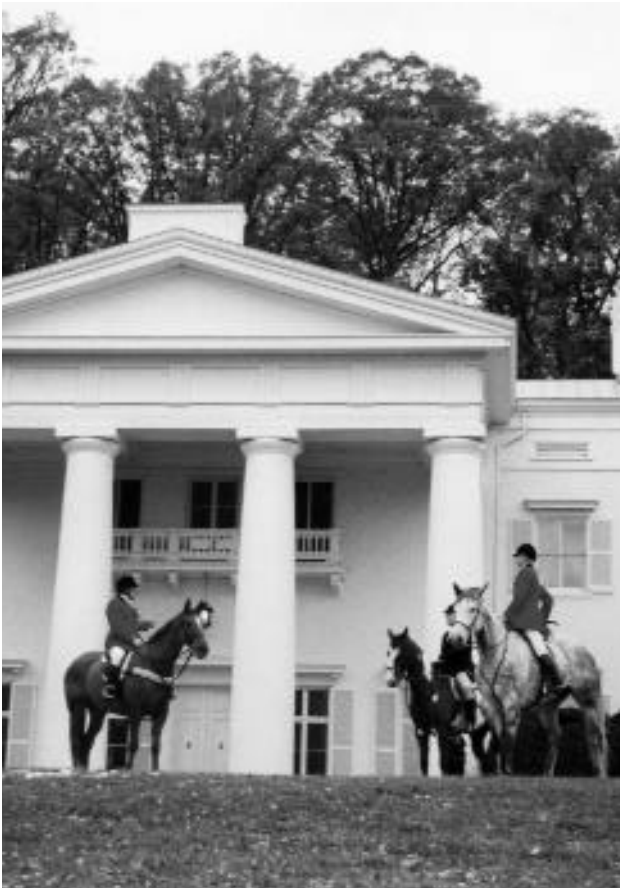
Loudon Convention & Visitors Association