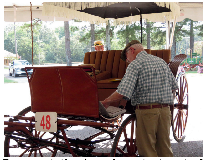
Documentation is an important part of your entry and counts toward your score.